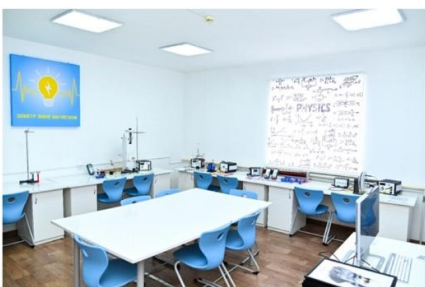
ZHUBANOV UNIVERSITY EQUIPS NEW LABORATORIES FOR FUTURE PHYSICISTS

The Department of Physics at the Faculty of Physics and Mathematics at Aktobe Regional University named after K. Zhubanov has been equipped with modern laboratories. This academic year, the "Mechanics," "Atomic Physics," and "Electricity and Magnetism" laboratories have been outfitted with new devices. These laboratories will host lectures not only for physics students but also for those enrolled in the general physics course, as well as for students of the Heriot-Watt University campus.