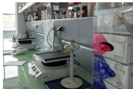
ZHUBANOV UNIVERSITY SCIENTIST DEVELOPED AN EFFECTIVE METHOD FOR EYE DISEASE TREATMENT