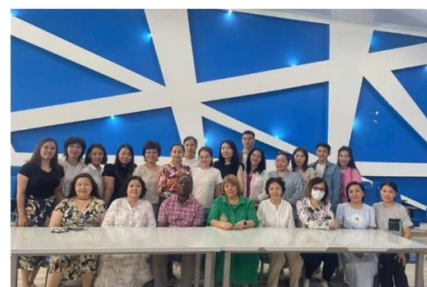
ZHUBANOV UNIVERSITY SCIENTISTS STUDIED STEM METHODOLOGY IN THE USA

With the support of the U.S. Embassy, the faculty members of Purdue University, an American research university, and Aktobe Regional University named after K. Zhubanov submitted a joint project to the American Councils for International Education and were included in the list of grant recipients in 2023. As a result, more than 40 faculty members from Kazakhstani universities enhanced their qualifications and received an international certification.