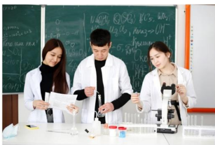
ZHUBANOV UNIVERSITY ACCREDITED AS A SUBJECT OF SCIENTIFIC AND SCIENTIFIC-TECHNICAL ACTIVITY FOR FIVE YEARS

Zhubanov University has received an accreditation certificate as a subject of scientific and scientific-technical activity for a period of five years, in accordance with Article 23 of the Science Law of the Republic of Kazakhstan. This certificate grants the university the right to participate in competitions for scientific and scientific-technical projects and programs funded by the state budget and other sources not prohibited by the legislation of the Republic of Kazakhstan. The accreditation decision was based on the university's scientific and technical potential, the level of research and development, the scale of practical implementation, and the preparation of highly qualified scientific personnel and scientific organizations.