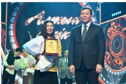
ZHUBANOV UNIVERSITY AWARDED "ZHYL UZDIGI" (BEST OF THE YEAR)

Aktobe Regional University named after K. Zhubanov was awarded the title of "Zhyl Uzdigi" for its significant role and foundational work in the national higher education system, the preparation of competitive specialists who meet the demands of the time, its fundamental contributions to expanding the horizons of science, and its scientific achievements.