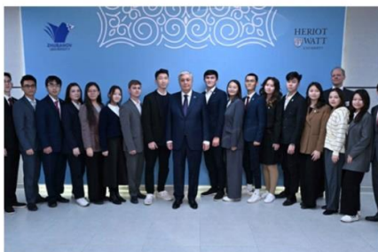
PRESIDENT VISITS HERIOT-WATT CAMPUS AT ZHUBANOV UNIVERSITY

During his working visit to the Aktobe region, President Kassym-Jomart Tokayev familiarized himself with the educational system of the Heriot-Watt University campus, located at Zhubanov University, and interacted with students. The President was presented with the university's scientific achievements and new educational programs.